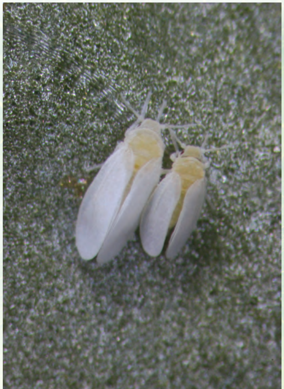
Bemisia tabaci male and female mating pair.

For managing both B and Q biotype, the name of the game is keeping population numbers low and breaking the life cycle and reproduction potential of the insect. In a good management program, monitoring and sending off whitefly samples for identification is a great step to help guide your selection of products for rotation and hopefully decrease the number of needed applications to keep sweet potato whitefly under