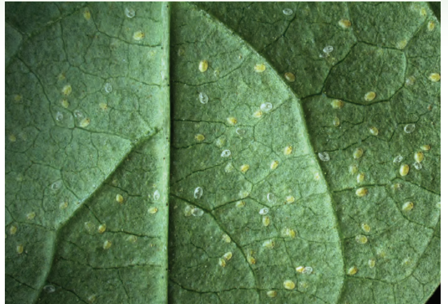
Mixed generation of whitefly nymphs.

By rotating products, we are exposing insects to different chemical classes as well as acting on different target sites. This variety reduces