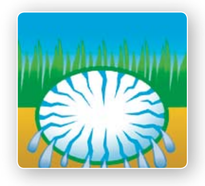
When the microcapsule is broken, it releases the pendimethalin.