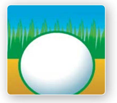
Pendulum AquaCap encapsulates a water-based formulation of the industry's leading preemergent active ingredient — BASF pendimethalin in an ultra-thin microcapsule.

Contact with a Pendulum AquaCap spray should be avoided on plants in full bud formation prior to leafing-out in spring and on grafts or bud-grafts of plants. Prior to any application of Pendulum AquaCap , consult the precautions and restrictions on the label. Refer to product label for a complete list of tested trees, shrubs, perennials, bedding plants, wildflowers, ornamental bulbs and non-bearing fruits, nuts and vines. Users should conduct small-scale tests under local growing conditions prior to wide-scale use.